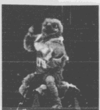
The new U. mascot makes his debut at the BYU-Utah game.