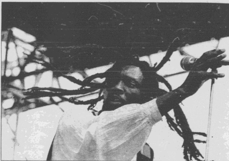
'Feeling all right': Luck Dube swings his dreadlocks during Planet Reggae, Sept. 1. Low ticket sales cost ASUU $40,000 in student fees.

formed on volunteers including 329 from the Utah State Prison.